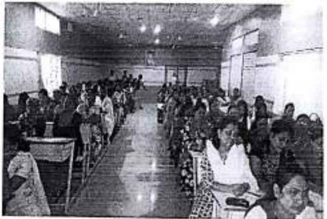
Resource person on dias taking session