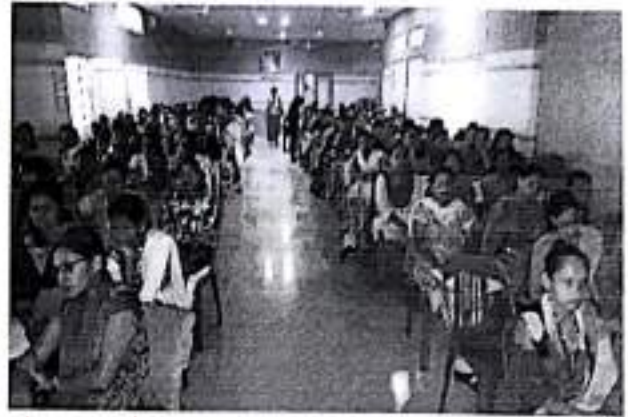
Speakers during felicitation session