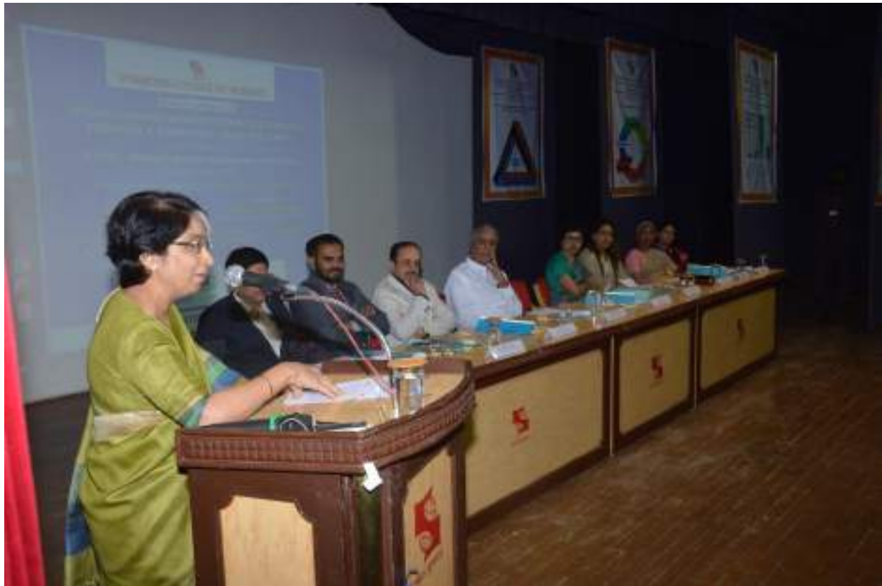
Session by Dignitaries