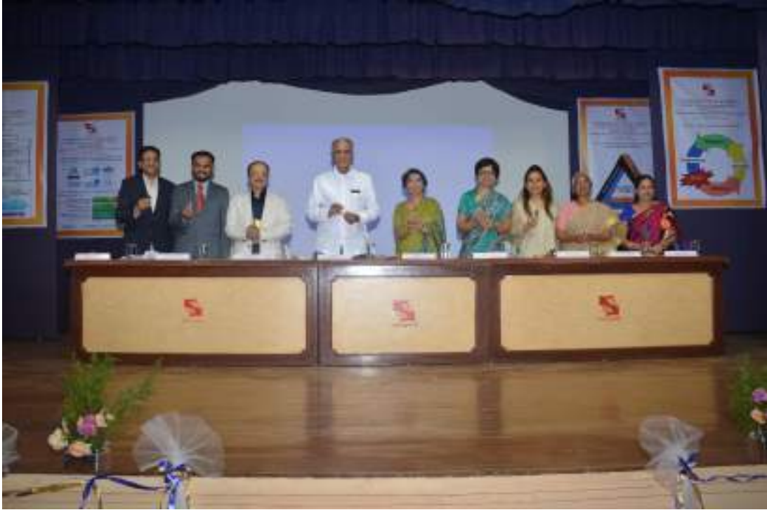
Inaugural of Conference