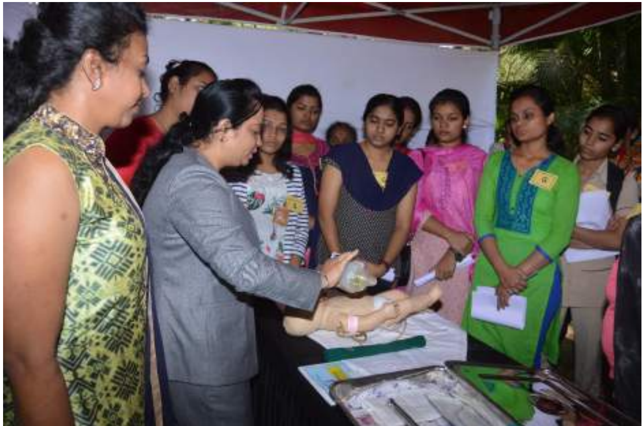
Skill Station on Neonatal Resuscitation