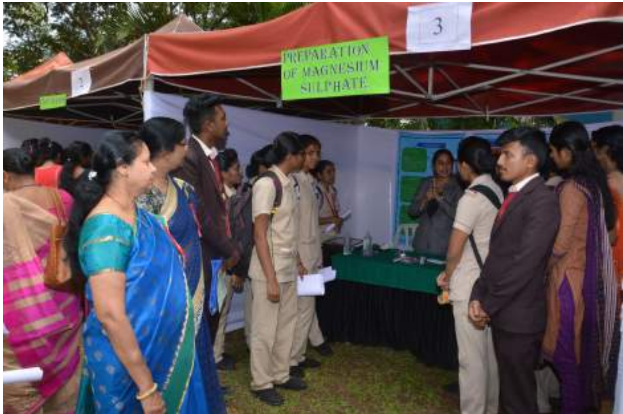
Skill Station on Preparation of Magnesium Sulphate