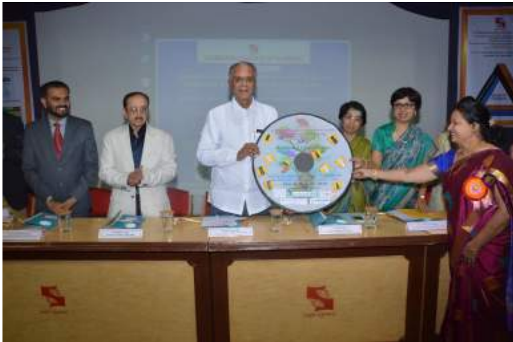
Inaugural of e- souvenir of Conference