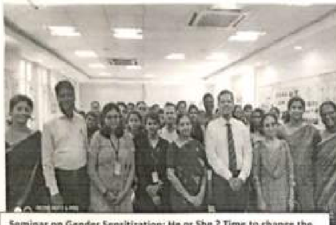
Seminar on Gender Sensitization; He or She ? Time to change the mindset-with delegates and resource persons