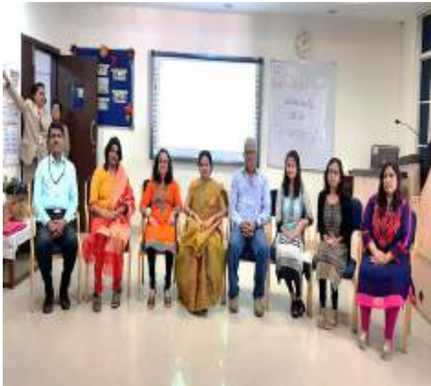
Group Photo along with Speakers