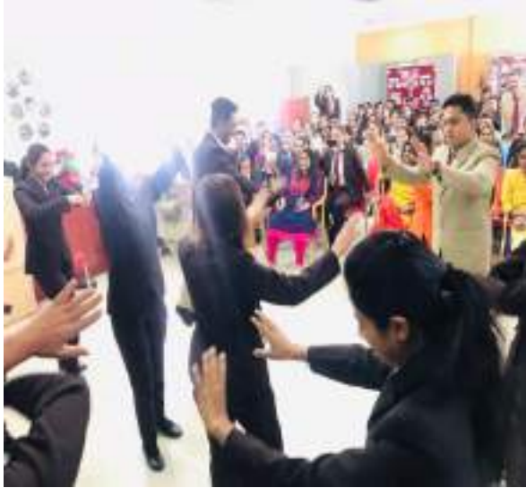
Delegates having activity session during Workshop