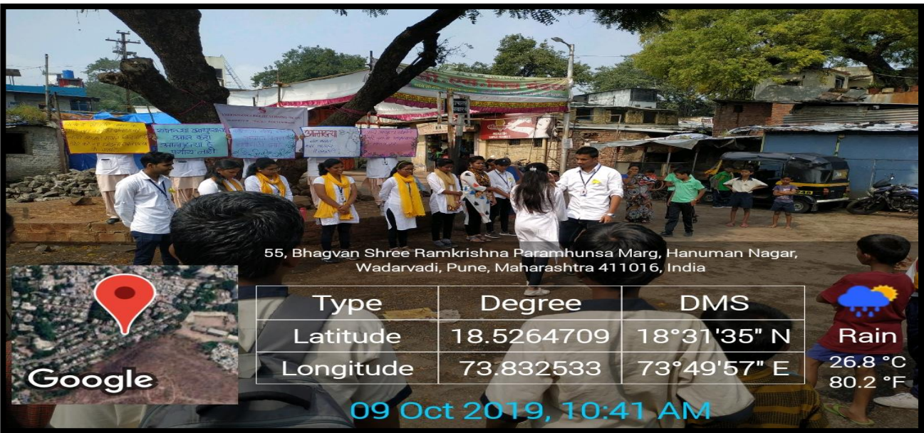
Street play - world mental health day

55, Bhagvan Shree Ramkrishna Paramhansa Marg, Hanuman Nagar, Wadarvadi, Pune, Maharashtra 411016, India