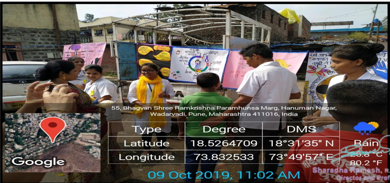
street play - world mental health day

55, Bhagvan Shree Ramkrishna Paramhansa Marg, Hanuman Nagar, Wadarvadi, Pune, Maharashtra 411016, India